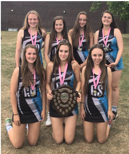
Undefeated U15Bs. P10, W9 D1

Website: www.stratfordthunderbirds.com Email: info@stratfordthunderbirds.com Twitter: @stratfordtbirds