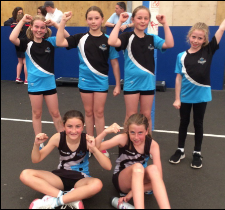
U10s Semi Finalists at Bury