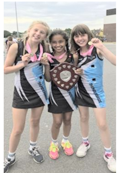
Undefeated U11Bs P10 W8 D2

A big hand also goes to our U12Bs who deserved so much more than their third place on paper.