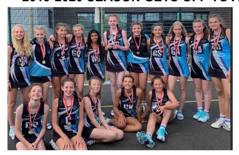
U13 are Cup Winners & U14A are Plate Winners at this year's Nottingham Tournament.